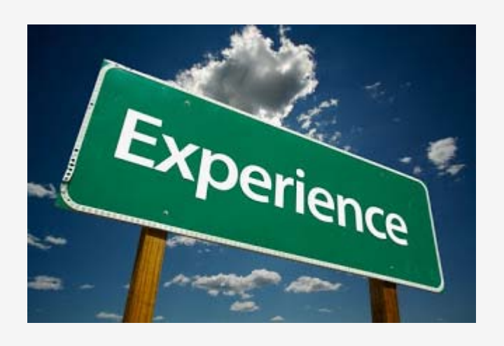
Dresden, 10<sup>th</sup> of July